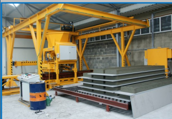
Fresh on fresh stacking on plywood pallets