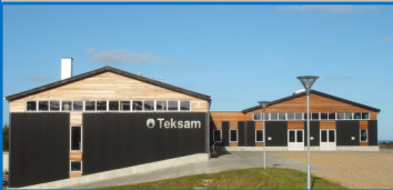
Teksam Headquarters in Denmark