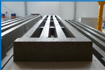
Hog & Cattle Slats