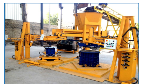
Dual set-up for Utility Boxes →