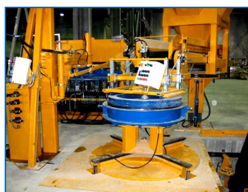
Dual set-up for ← Grade Rings