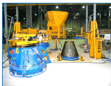
Dual set-up for ← Cones

These and many other benefits have resulted in an increasing number of "Teksam 1250 Dual Stations" already successfully installed - worldwide!